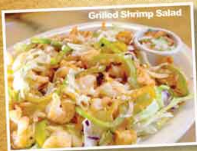
Grilled Shrimp Salad