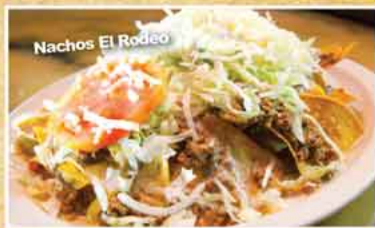
Nachos El Rodeo